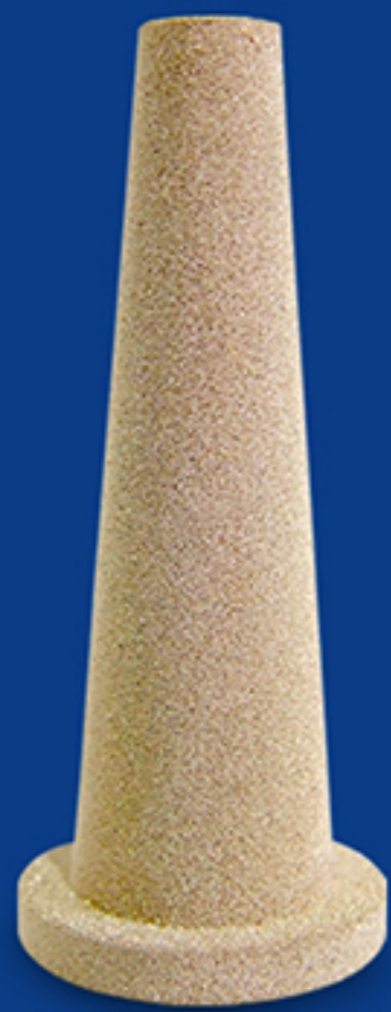
Konusni delovi sa ili bez stope Conical moulds with or without flange